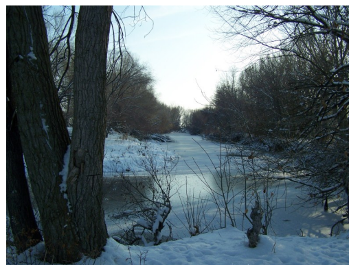
Photo: Frozen bend on the Provo River near the mouth at Utah Lake (Provo, Utah).

In drafting this report, the Bureau of Reclamation (Reclamation), US Army Corps of Engineers (USACE), and National Oceanic and Atmospheric Administration’s (NOAA) National Weather Service (NWS) described a critical need to identify potential enhancements in the development and use of monitoring and forecasting information within short-term water resources management beyond the use of current hydroclimatic