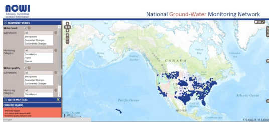
Screen shot of National Groundwater Monitoring Network web-based mapping application—click the figure to visit the NGWMN homepage

during their April Meetings in Tulsa Oklahoma, on selected federal water-data activities including continued progress on the “Water Quality Portal.” The Water Quality Portal is a cooperative service sponsored by the U.S. Geological Survey (USGS), the Environmental Protection Agency (EPA) and the National Water Quality Monitoring Council that integrates publicly available water quality data from principal USGS, EPA and data bases. Patrick