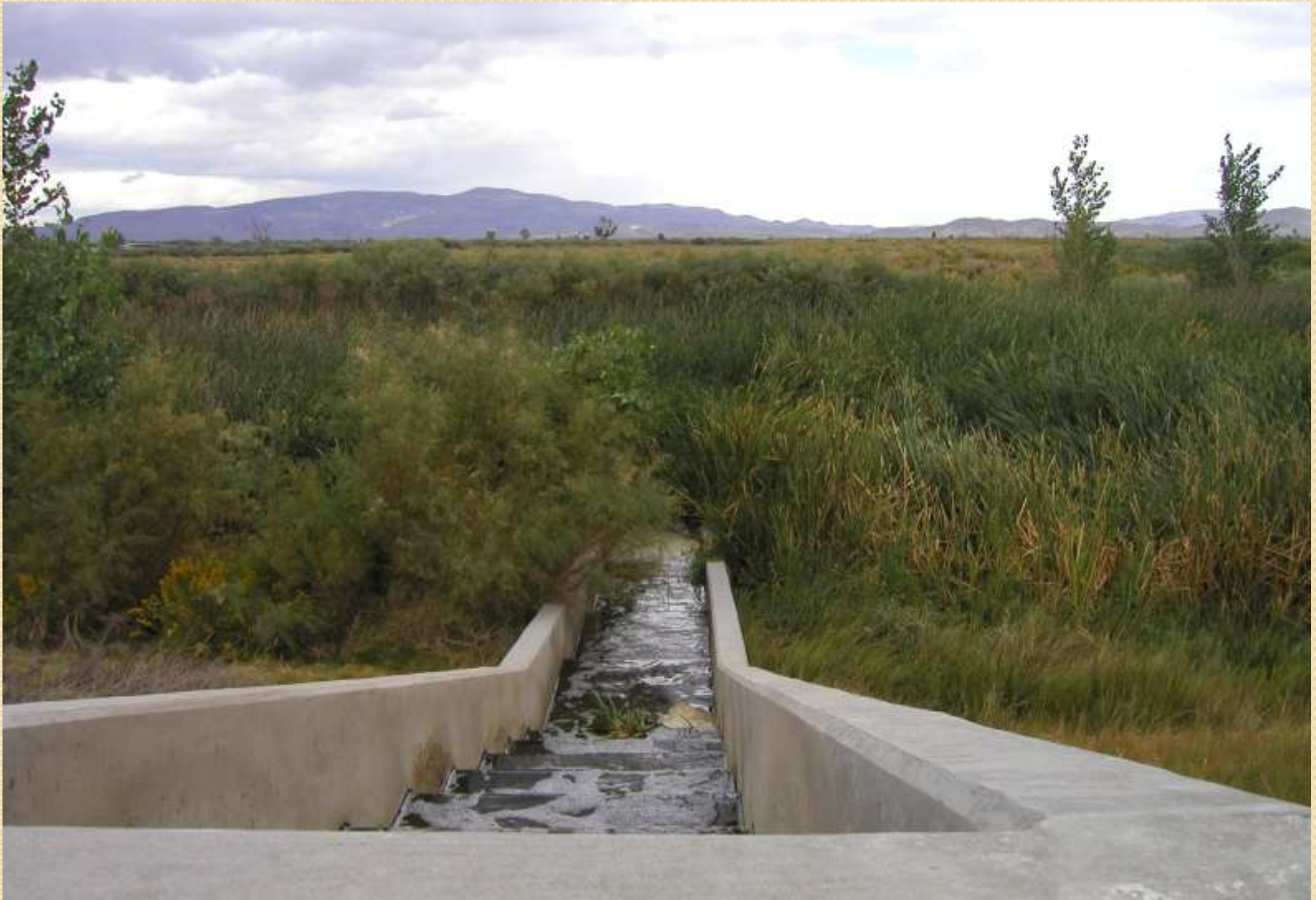
Mason Valley Wildlife Area - City of Yerington Effluent