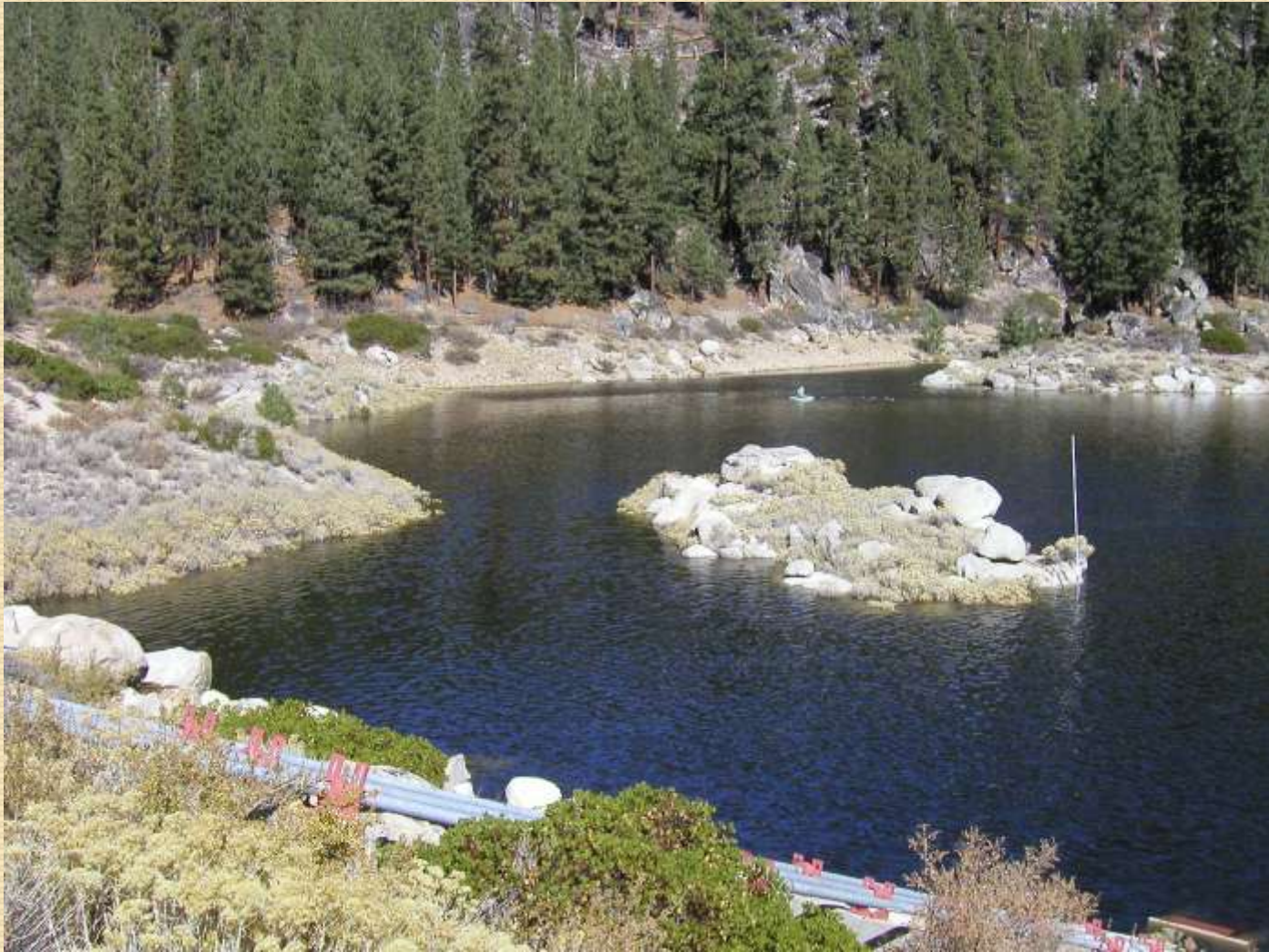
Effluent Storage Reservoir at Lake Tahoe reuse water piped to Carson Valley for agricultural irrigation