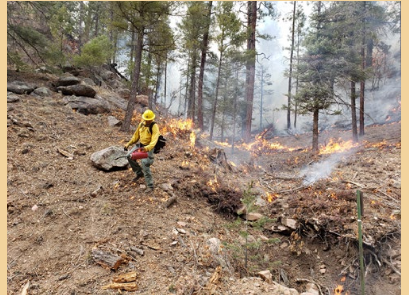
A Northern Pueblos Tribal fuels crew member conducts a prescribed burn on Tesuque Reserved Treaty Rights Lands adjacent to the Santa Fe National Forest.