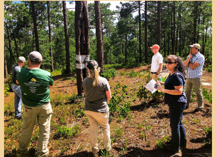
A duff (shed vegetation on forest floor) workshop offered by Southern Fire Exchange, 2019.