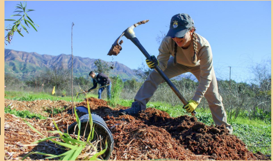
FWS personnel replant native species on a site burned during the 2017 Thomas Fire.