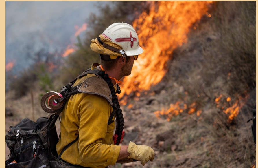
A wildland firefighter works on the Doagy Fire in New Mexico in 2021.