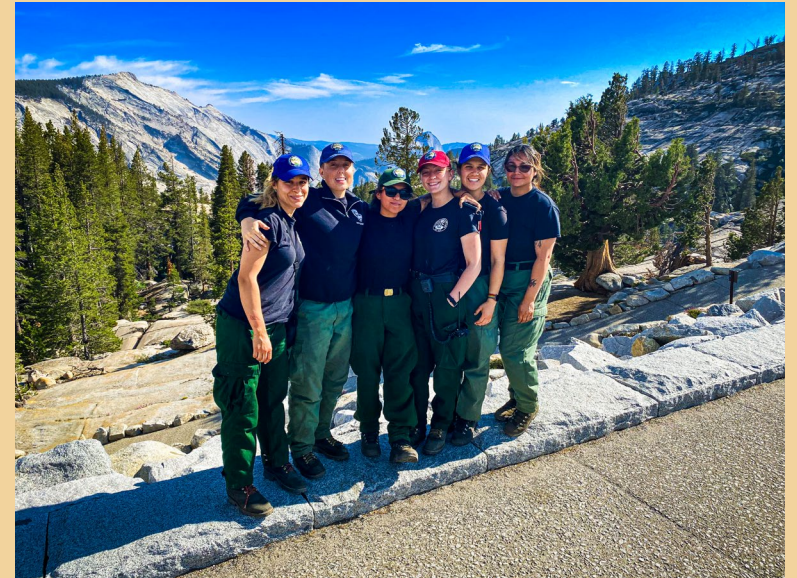
All-women Conservation Corps firefighting crew at Yosemite National Park in California.