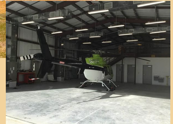
FWS renovated an aircraft hangar in Okefenokee National Wildlife Refuge in Georgia and Florida.