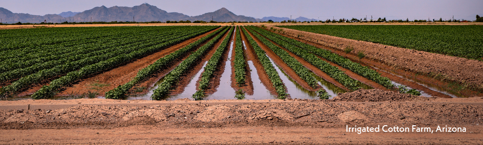
Irrigated Cotton Farm, Arizona