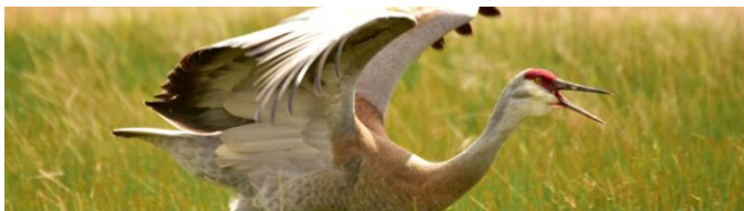
A greater sandhill crane reacts to the approach of a bald eagle. The bald eagle is closing in on a sandhill crane colt (juvenile) hidden nearby.

WASHINGTON – Secretary of the Interior Deb Haaland today announced that $95 million in funding has been approved by the Migratory Bird Conservation Commission , which will provide the U.S. Fish and Wildlife Service and its partners the ability to help conserve or restore more than 300,000 acres of wetland and associated upland habitats for waterfowl, songbirds and other birds across North America – including Canada and Mexico.