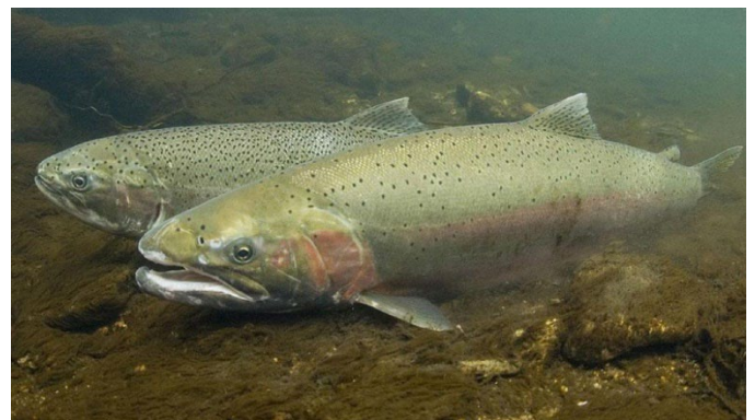
Male and female steelhead trout.

Today, the Department of Commerce and NOAA are announcing the availability of up to $106 million in funding through the Pacific Coastal Salmon Recovery Fund (PCSRF) for Pacific salmon and steelhead recovery and conservation projects. This funding — which includes funding from the Bipartisan Infrastructure Law (BIL) and Inflation Reduction Act (IRA) — will support state and tribal salmon restoration projects and activities to protect, conserve and restore these fish populations and their habitats.