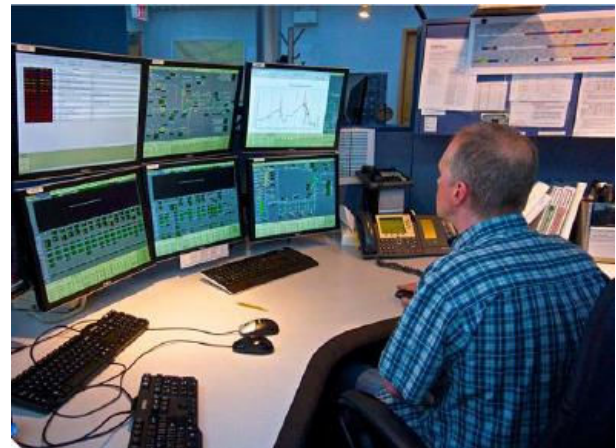
Water utility operator monitoring computerized systems

Today the U.S. Environmental Protection Agency (EPA) and its federal partners announced the Industrial Control Systems Cybersecurity Initiative – Water and Wastewater Sector Action Plan to help protect water systems from cyberattacks. The Action Plan focuses on high-impact activities that can be surged within 100 days to safeguard water resources by improving cybersecurity across the water sector.