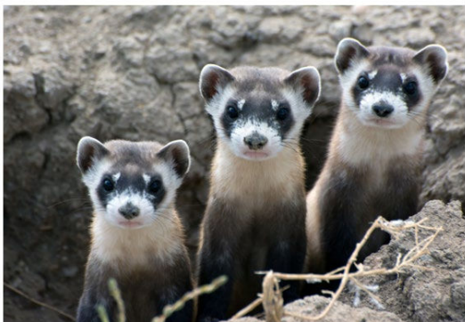
Endangered black-footed ferret kits.

In the first Endangered Species Act (ESA) interpretive rule produced under the Biden-Harris administration, the U.S. Fish and Wildlife Service is proposing to revise section 10(j) regulations under the ESA to better facilitate recovery by allowing for the introduction of listed species to suitable habitats outside of their historical ranges. The proposed change will help improve the conservation and recovery of imperiled ESA-listed species in the coming decades, as growing impacts from climate change and invasive species cause habitats within their historical ranges to shift and become unsuitable.