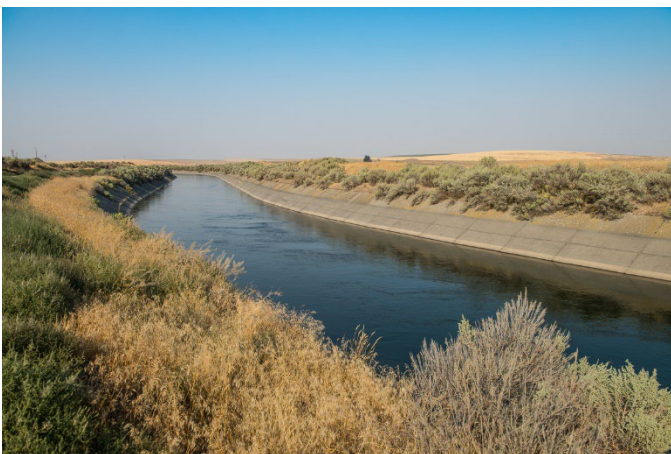
A canal running through central Washington. Fourteen projects in eight states will receive $25.5 million in Bipartisan Infrastructure Law funding.

WASHINGTON – The Department of the Interior today announced $25.5 million in Bipartisan Infrastructure Law funds for WaterSMART Water and Energy Efficiency Grants to safeguard local water supplies in the face of severe western drought.