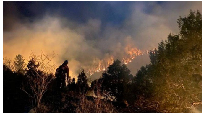
The Silver City Hotshots conduct firing operations along Highway 518 west of Holman, New Mexico, on May 9, 2022, during the Hermits Peak Fire. The fire became New Mexico’s largest wildfire in state history in May 2022, scorching more than 315,000 acres.

May was warm and wet across the Lower 48, according to scientists from NOAA’s National Centers for Environmental Information. The month also wrapped up a warm spring as wildfires continued to burn across the nation. Below are highlights from NOAA’s U.S. monthly climate report for May 2022: