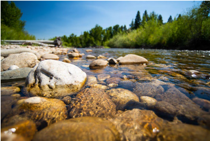
Funding is available for projects that will result in significant benefits to ecosystem or watershed health.

The Bureau of Reclamation is making approximately $80 million from President Biden's Bipartisan Infrastructure Law available for water conservation, water management and restoration projects that will result in significant benefits to ecosystem or watershed health.