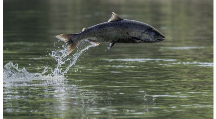
An endangered Chinook Salmon jumps in the California Sacramento River.

Bipartisan Infrastructure Law investments will enhance critical recovery efforts