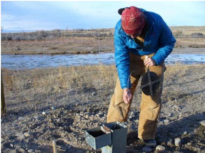
A USGS scientist measures the groundwater level using a steel tape in a shallow well near Wind River at Kinnear, WY