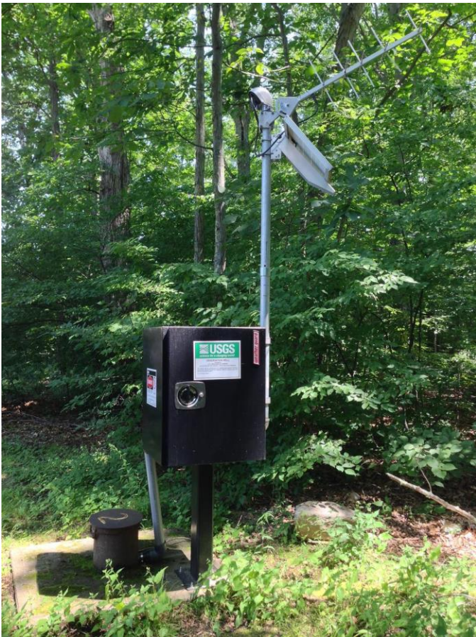
USGS groundwater site 414831072173002 in Tolland County, Connecticut. This well is equipped with a transducer and equipment that allows groundwater level data to be transmitted in real-time.

These two methods of data collection create a data-rich record with varying data frequency over time; you can see this in our many groundwater monitoring location pages . Due to changing methodology over time, we often serve the data using multiple methods or parameters over the period of record. We also calculate some statistics from instrumented data called daily value data. This metadata is important, but may not consistently be available over the period of record.